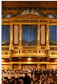
Shanghai Opera House Chorus