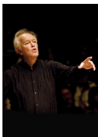
Edo de Waart

Click the thumbnail to download press images [Or hold Ctrl then click to open the file]