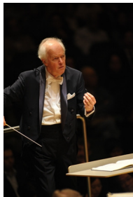
Edo de Waart

Click the thumbnail to download press images [Or hold Ctrl then click to open the file]