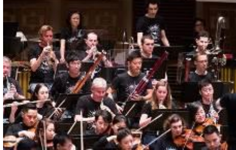
The Hong Kong Philharmonic Orchestra