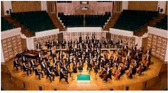
The Hong Kong Philharmonic Orchestra