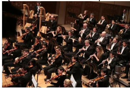
The Hong Kong Philharmonic Orchestra