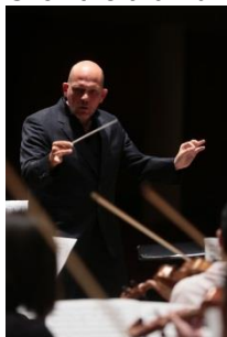
Jaap van Zweden

Click the thumbnails to download press images [Or hold Ctrl then click to open the file]