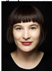
Gun-Brit Barkmin as Brünnhilde