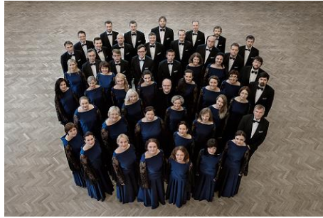
State Choir Latvija