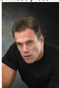
Tzimon Barto