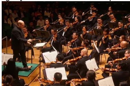
Hong Kong Philharmonic Orchestra