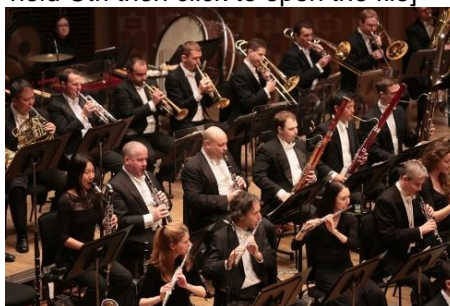
The Hong Kong Philharmonic Orchestra