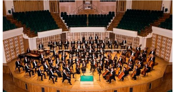
The Hong Kong Philharmonic Orchestra