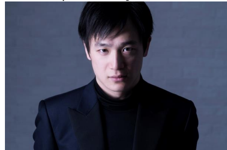
Chiyang Wong