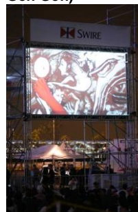
Swire Symphony Under The Stars 2015