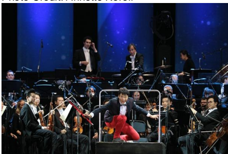
Swire Symphony Under The Stars 2015