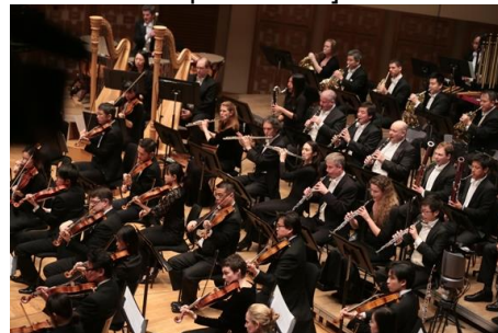
The Hong Kong Philharmonic Orchestra