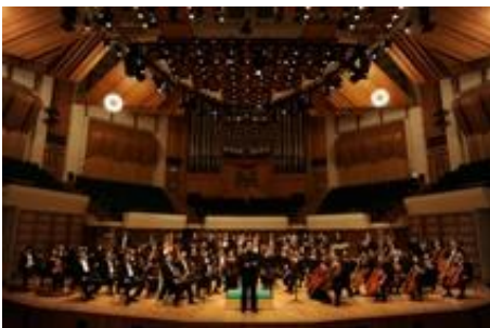
The Hong Kong Philharmonic Orchestra