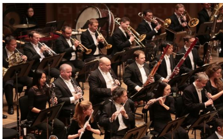
The Hong Kong Philharmonic Orchestra