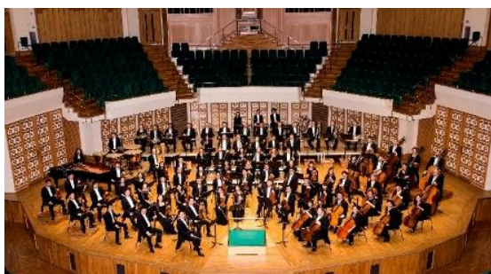
The Hong Kong Philharmonic Orchestra