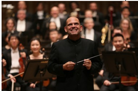
Jaap van Zweden

Click the thumbnails to download press images [Or hold Ctrl then click to open the file]