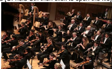
The Hong Kong Philharmonic Orchestra