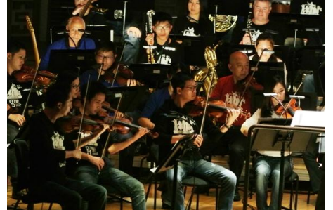
Hong Kong Philharmonic Orchestra Swire Denim