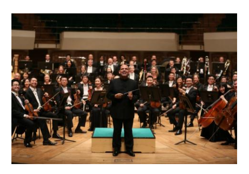
HK Philharmonic Orchestra