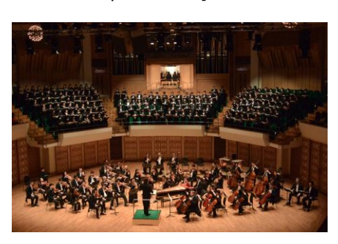
Hong Kong Philharmonic Orchestra and Hong Kong Philharmonic Chorus