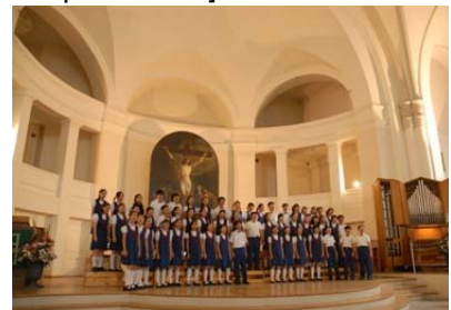
The Hong Kong Children's Choir