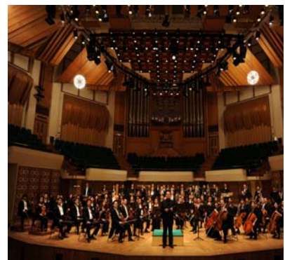
Hong Kong Philharmonic