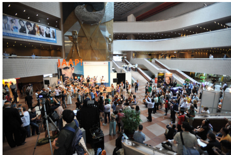
07. Over 70 HKPO players “blast up” the vast Foyer of the Hong Kong Cultural Centre