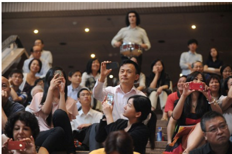
05. Over 70 orchestra players suddenly appear at Press Launch in a “flash mob” performance in Ravel's Bolero . The audience are so excited to capture the fascinating moments