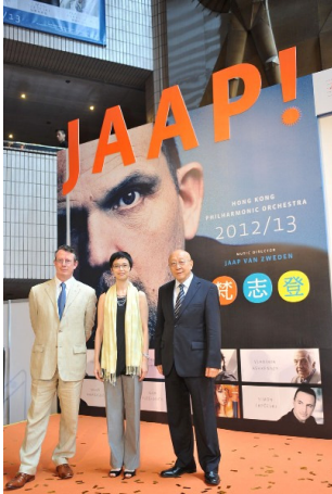
03. Group photo after the inaugural ceremony