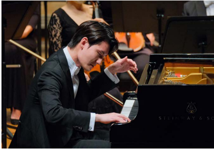
鋼琴家牛牛 Pianist Niu Niu