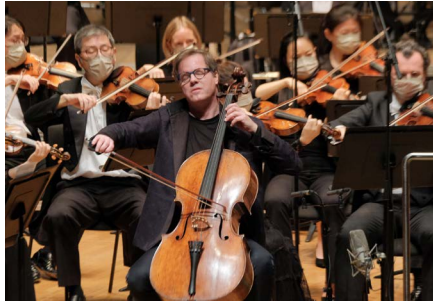
大提琴家霍格勒 Cellist Jan Vogler