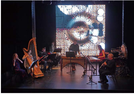
茶館室樂系列：香港管弦樂團：遙聽夜鶯 Tea House Chamber Music Series: HK Phil: Nightingale in Distance