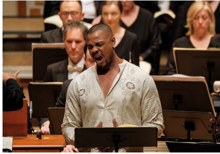
低男中音提內斯 Bass-baritone Davóne Tines