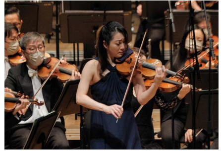
小提琴家諏訪內晶子 Violinist Akiko Suwanai