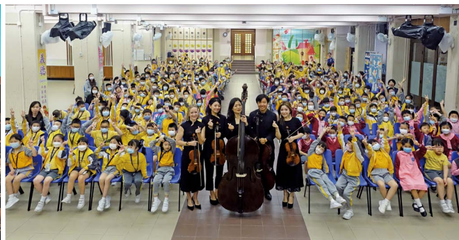
室樂小組到校表演 Ensemble Visit