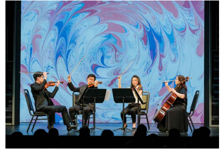
茶館室樂系列：香港管弦樂團：旅人心弦 Tea House Chamber Music Series: HK Phil: Musical Postcards