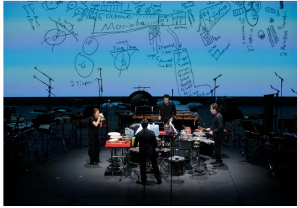
港樂@自由空間：譚盾 | 六月雪 HK Phil @ Freespace: Tan Dun | Snow in June