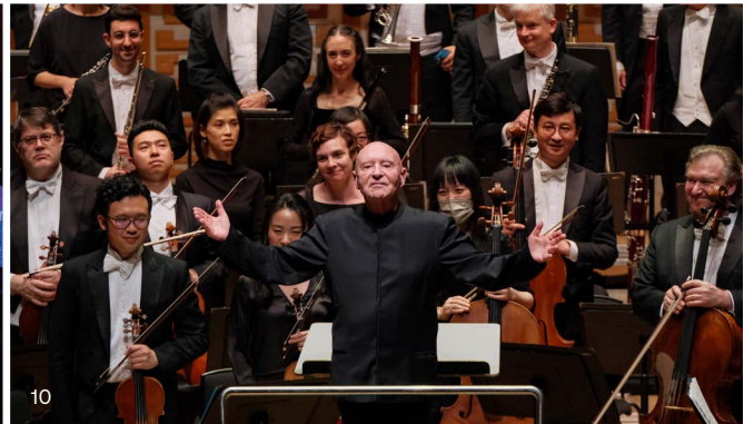
| 7 | 基特寶演奏浦羅哥菲夫第三鋼琴協奏曲 Boris Giltburg playing Prokofiev's Piano Concerto no. 3 | 8 | 陳銳拉奏孟德爾遜小提琴協奏曲 Ray Chen playing Mendelssohn's Violin Concerto | 9 | 「阿爾卑斯——交響曲再想像」音樂會配以壯觀的影像放映 The concert "An Alpine Symphony in Images" was presented with screening projection | 10 | 艾遜巴赫指揮了布魯赫納第四交響曲 Christoph Eschenbach conducted Bruckner's Symphony no. 4