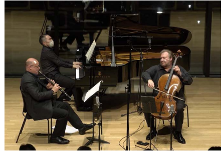
港樂 × 大館：室樂音樂會系列：三人行 HK Phil × Tai Kwun: Chamber Music Series: Trio Rendezvous