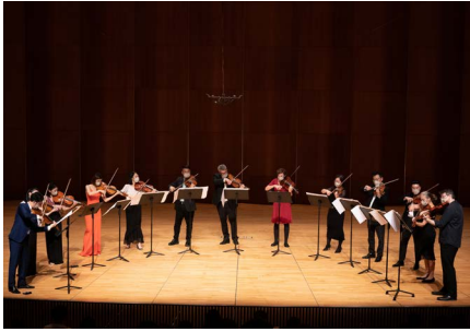
港樂 × 港大繆思樂季：聚焦管弦：中提琴 HK Phil × HKU Muse: Orchestral Spotlights: Viola