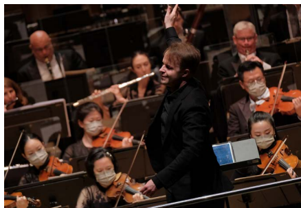
指揮柯蘭瑠 Conductor Taavi Oramo