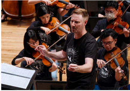
指揮羅菲 Conductor Benjamin Northey