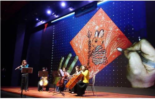
港樂樂師在新開幕的香港故宮文化博物館演出 HK Phil musicians performing at the newly open Hong Kong Palace Museum