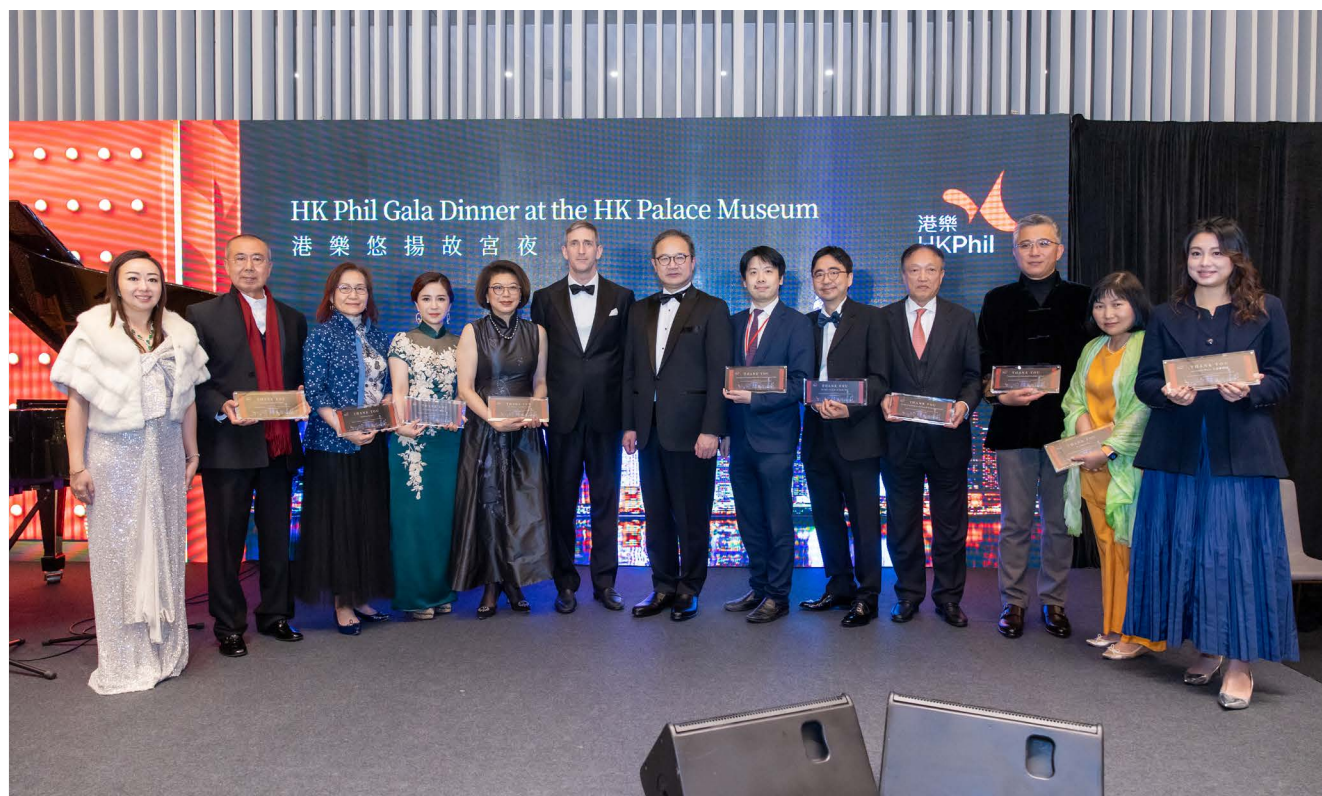
香港管弦樂團慈善晚宴「港樂悠揚故宮夜」HK Phil Gala Dinner at the Hong Kong Palace Museum