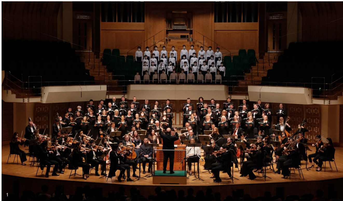
1 | 音樂總監梵志登指揮巴赫《馬太受難曲》 Music Director Jaap van Zweden conducting Bach's St Matthew Passion