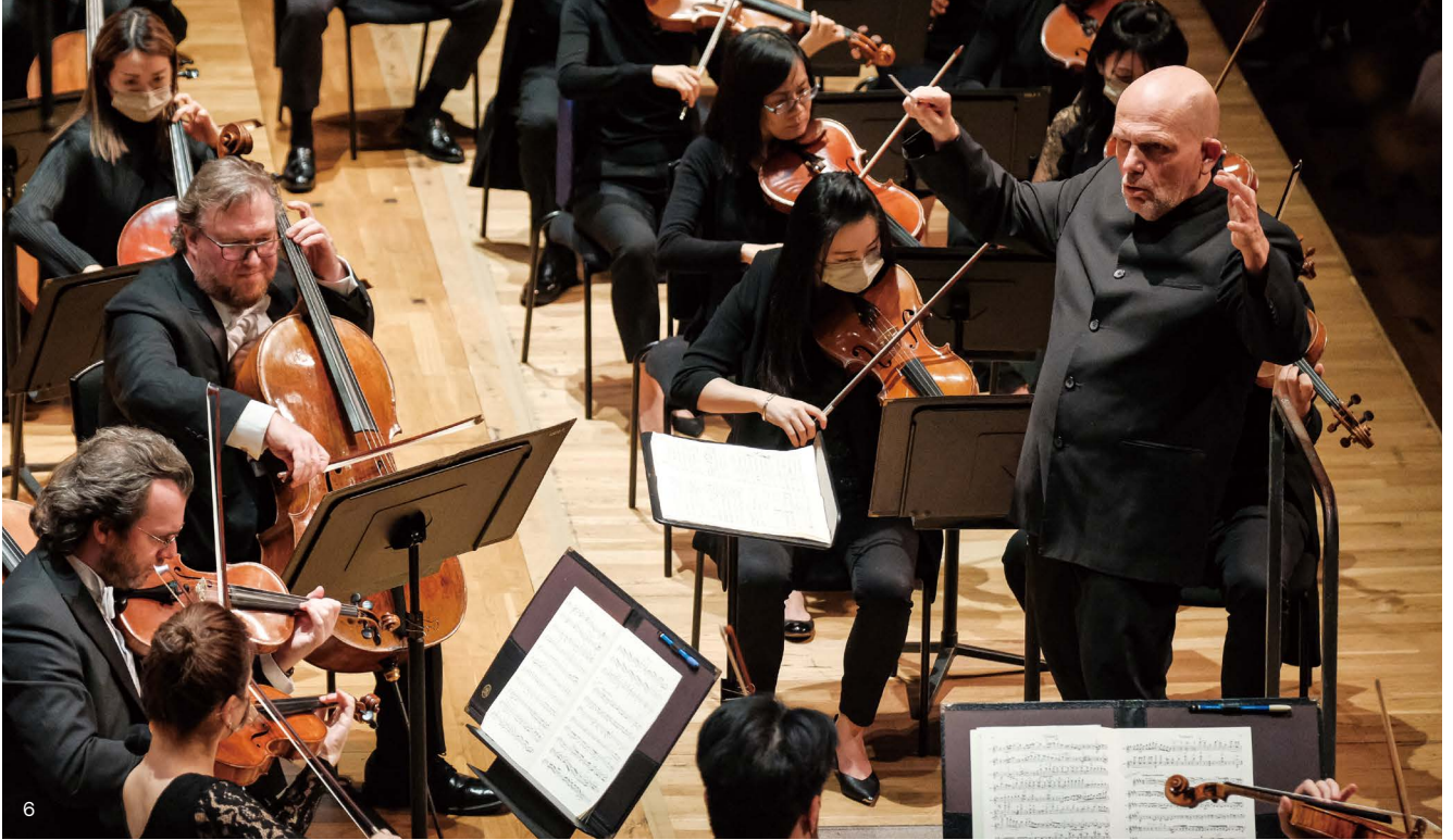
| 6 | 梵志登帶領港樂演出布拉姆斯全套交響曲 Jaap van Zweden leading the HK Phil to perform the complete Brahms Symphony cycle