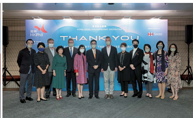
酬謝贊助人音樂會 Donor's Thank You Concert