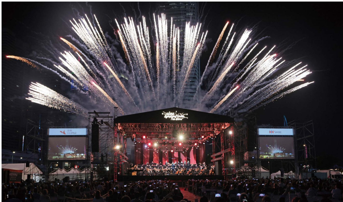
| 1 | 太古「港樂·星夜·交響曲」載譽重臨中環海濱 Swire Symphony Under The Stars returned live to the Central Harbourfront

The HK Phil's free annual outdoor mega-concert took place in November 2022. The live performance was simultaneously streamed on various online platforms.