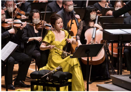
二胡演奏家陸鞅文 Erhu player Yiwen Lu