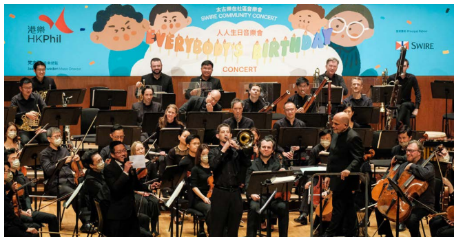
太古社區音樂會：人人生日音樂會 Swire Community Concert: Everybody's Birthday Concert