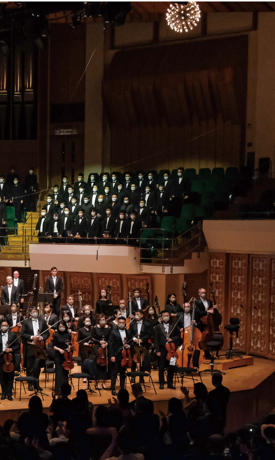
樂季揭幕：梵志登 | 貝九 Season Opening: Jaap | Beethoven 9