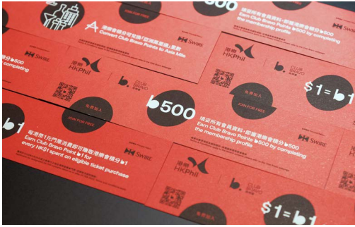
港樂會員獎賞計劃港樂會於2023年以全新面貌示人 HK Phil audience loyalty programme Club Bravo was restructured in 2023

時，全新港樂會網站讓會員掃描音樂會門票以賺取積分。觀眾可以使用積分按個人喜好兌換音樂會門票、合作夥伴獎賞及航空公司里程等。新計劃推出後迅速獲得觀眾支持，在推出後首七周內錄得200萬積分，新會員數目在首月錄得20%增長。