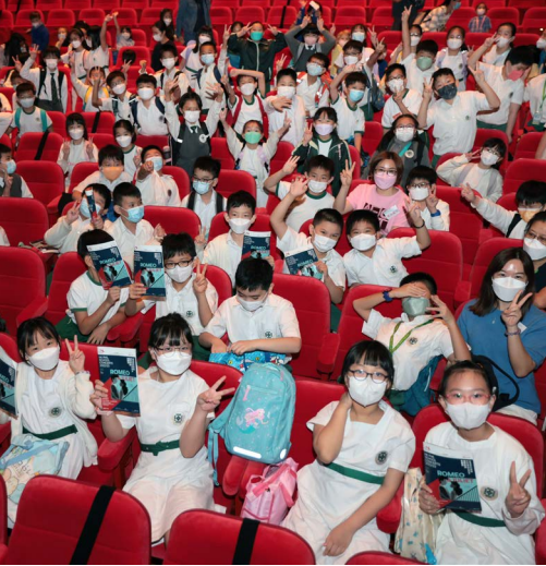
《羅密歐與茱麗葉》主題的學校專場音樂會 School concert with a Romeo & Juliet theme