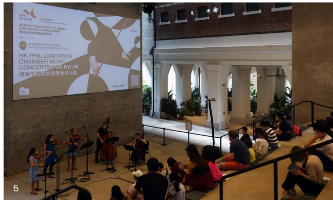
| 3 | 港樂與桃花源粵劇工作坊攜手呈獻啟發自《帝女花》的大型管弦樂作品 In collaboration with Utopia Cantonese Opera Workshop, the HK Phil presented the brand-new orchestral re-imagining of the classic Floral Princess | 4 | 港樂獲香港科技大學邀請於都會音樂節演出 The HK Phil was invited by the Hong Kong University of Science and Technology to perform at the Cosmopolis Festival | 5 | 港樂於大館洗衣場石階舉辦室樂音樂會 HK Phil chamber music concert at Tai Kwun's Laundry Steps