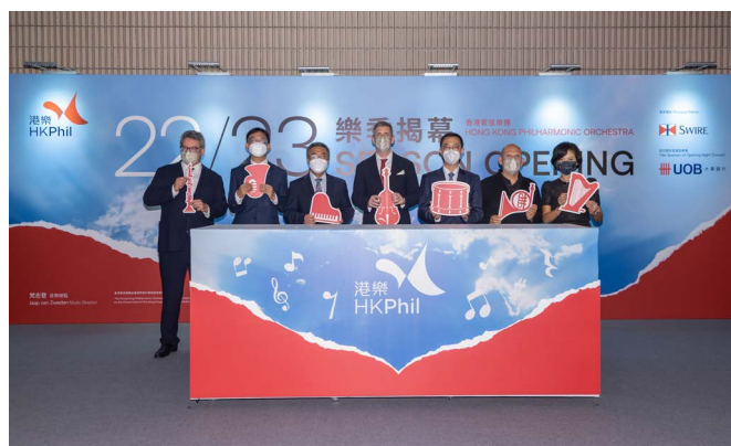
2022/23 樂季揭幕典禮 2022/23 Season Opening Ceremony