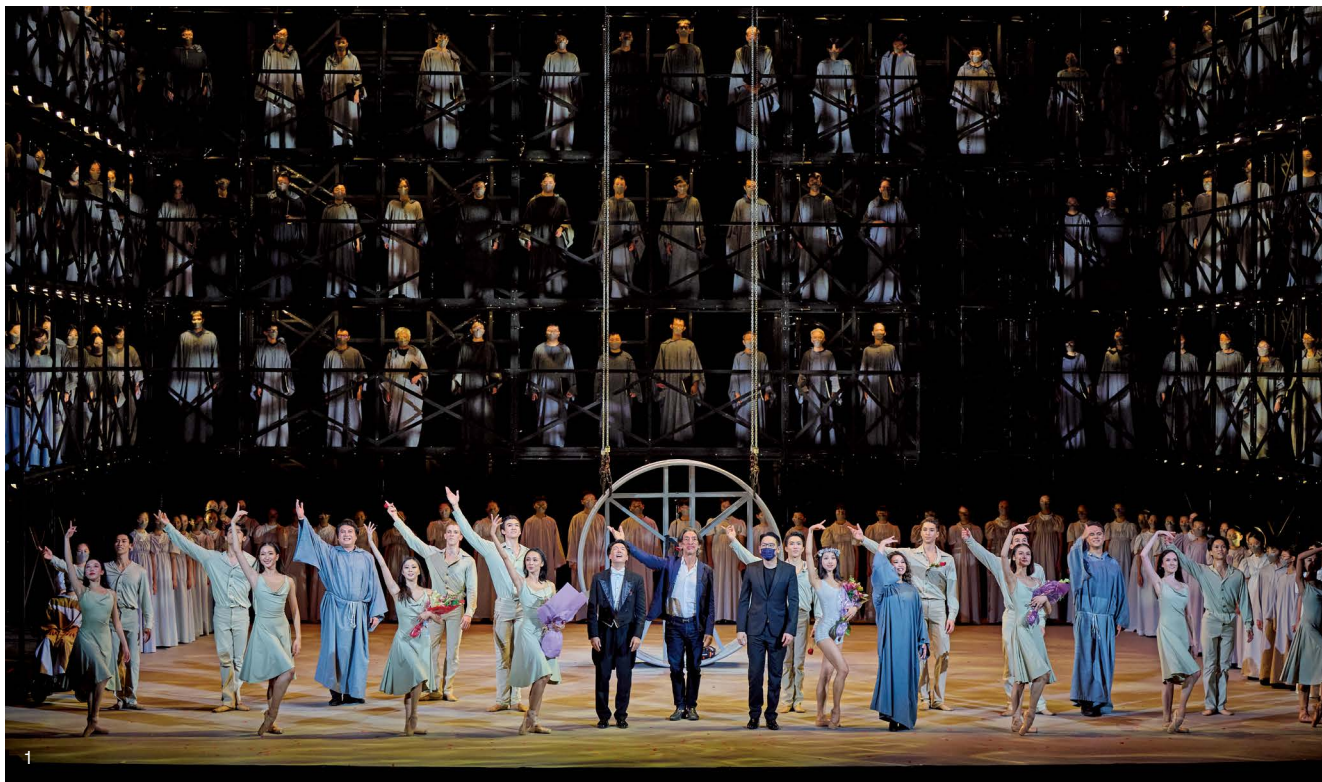
| 1 | & | 2 | 港樂與香港芭蕾舞團聯合呈獻經典舞劇《布蘭詩歌》The HK Phil and Hong Kong Ballet co-presented Carl Orff's iconic Carmina Burana

The HK Phil continues its audience building efforts through collaborations with different organisations, presenting a variety of programmes of chamber music and full orchestral works.