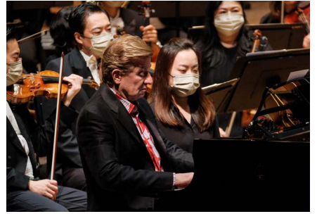
鋼琴家蒂博代 Pianist Jean-Yves Thibaudet