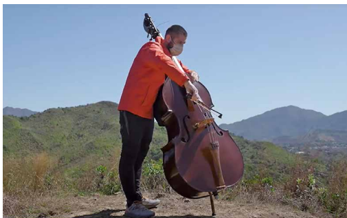
「港玩·港樂」第2季：天·地·人 Phil Your Life Season 2: Inspiration, Sky & Earth