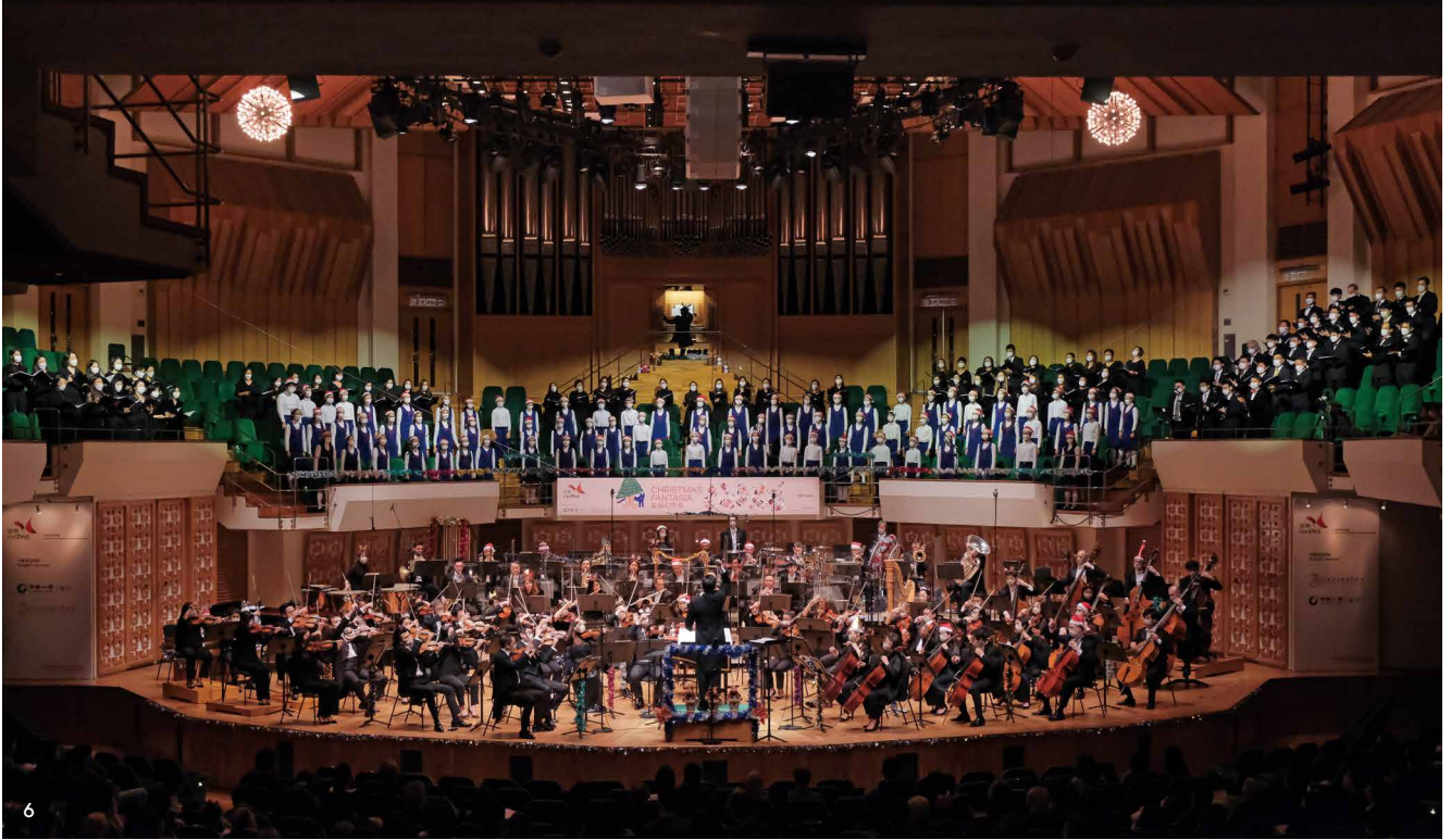
6 | 聖誕幻想曲 Christmas Fantasia