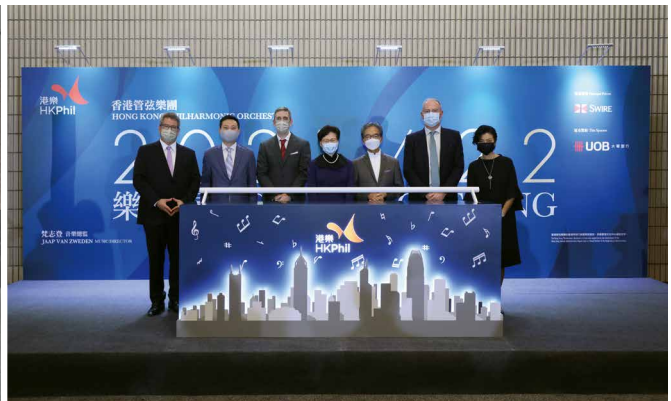
2021/22 樂季開幕典禮 2021/22 Season Opening Ceremony