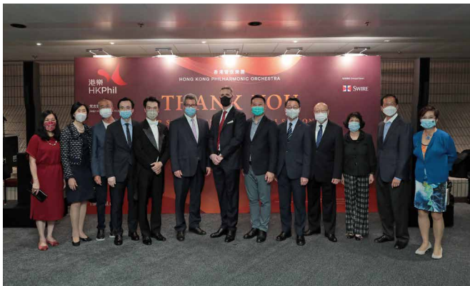
酬謝贊助人暨 2020/21 樂季壓軸音樂會 Donor's Thank You Concert and 2020/21 Season's Finale