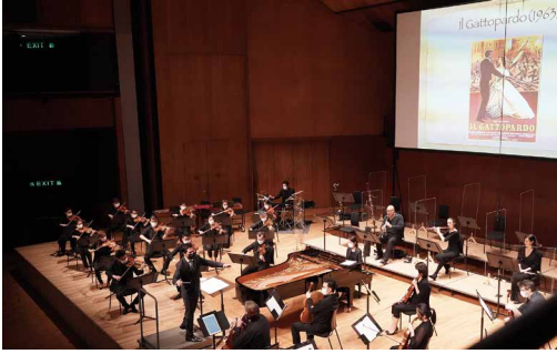
太古樂賞「向羅塔與費里尼致敬」 Swire Classic Insights "Homage to Nino Rota & Federico Fellini"