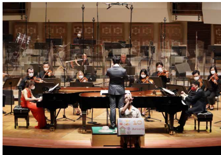
動物嘉年華 Carnival of the Animals