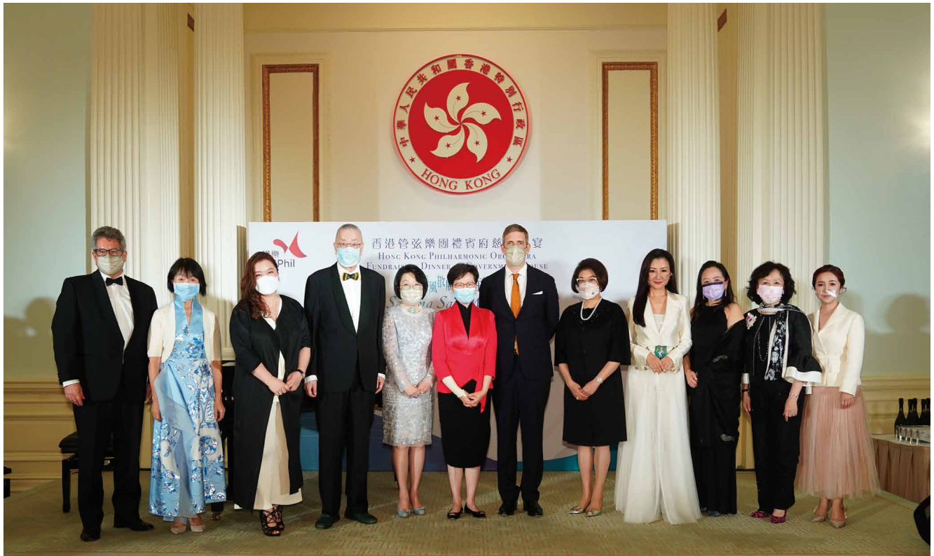
香港管弦樂團禮賓府慈善晚宴 HK Phil Fundraising Dinner at Government House