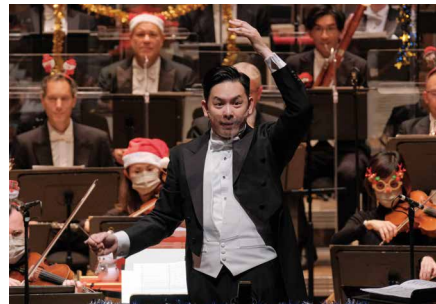
指揮兼低男中音黃日珩 Conductor and bass-baritone Apollo Wong