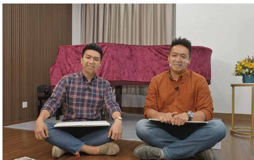
「賽馬會音樂密碼教育計劃」網上靜觀創意活動 Jockey Club Keys to Music Education Programme: Online Mindfulness Activity