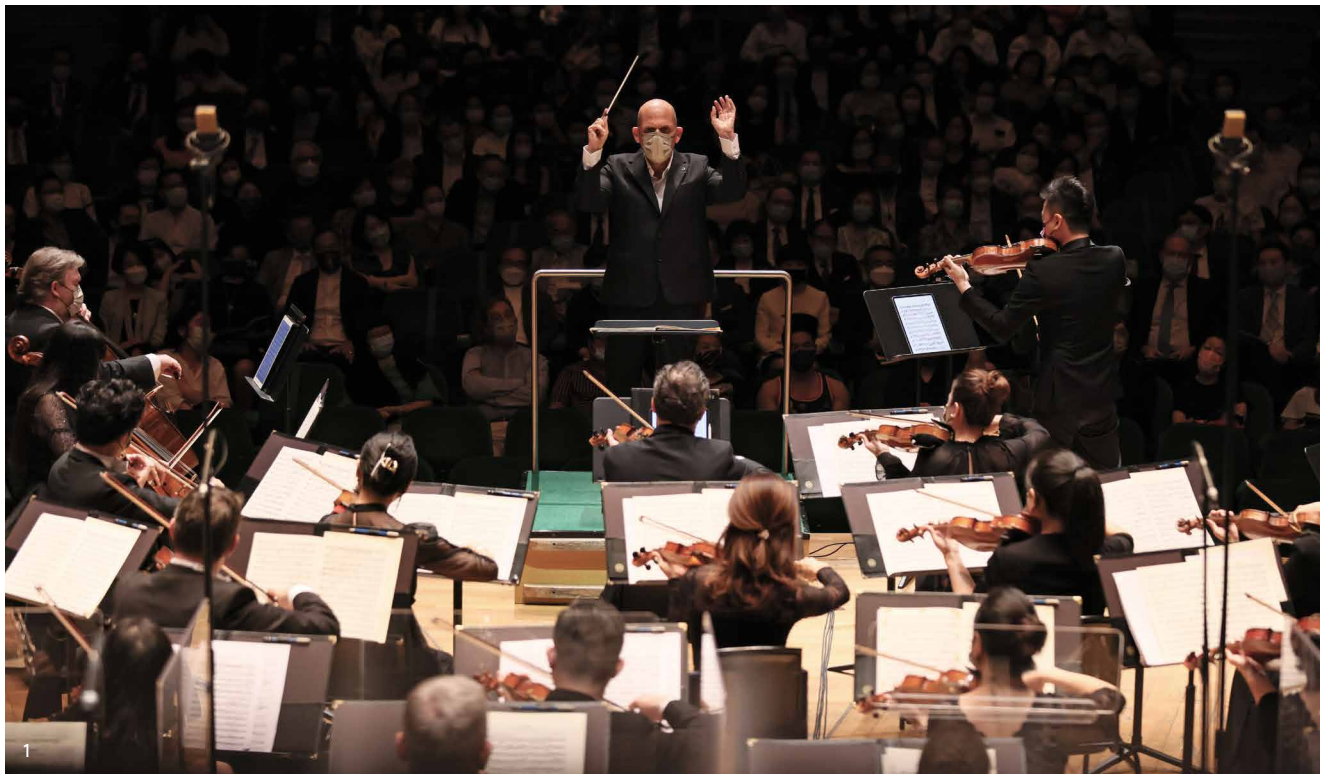
1 | 樂季揭幕：梵志登 | 貝七 Season Opening: JAAP | Beethoven 7