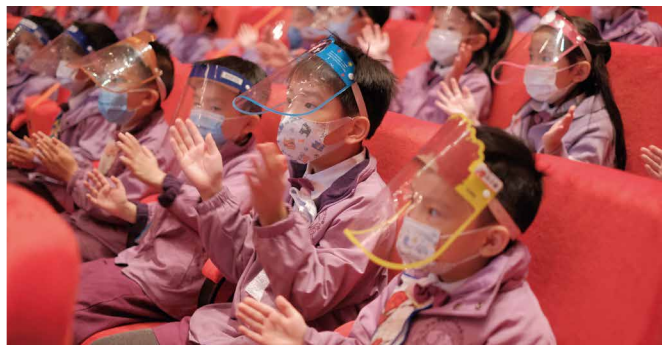
「賽馬會音樂密碼教育計劃」學校專場音樂會 Jockey Club Keys to Music Education Programme: School Concerts