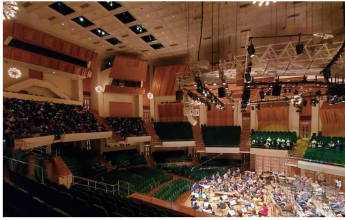
公開採排 Open rehearsal

於洗衣場石階舉行的午間音樂會（長號四重奏、單簧管三重奏、弦樂五重奏）和立方舉行的晚間音樂會（木管五重奏、銅管五重奏、鋼琴管樂五重奏、弦樂四重奏）。