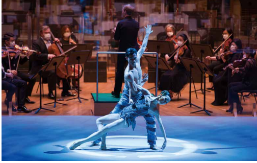
與香港芭蕾舞團合作演出 Collaboration with Hong Kong Ballet

孔茲帶領港樂演奏佛瑞《佩利亞斯與梅麗桑德》選段及莫扎特《小夜曲》選段，同時幾名港芭蕾舞員在現場音樂伴隨下，表演由港芭藝術總監衛承天編排的舞蹈。