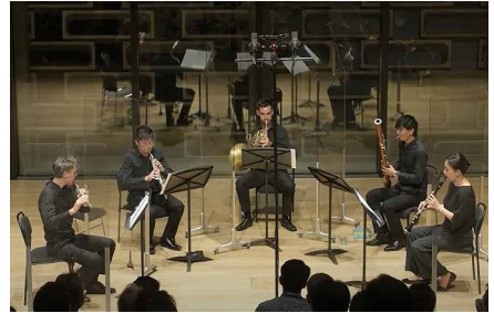
港樂木管五重奏於大館演出 HK Phil Woodwind Quintet@Tai Kwun