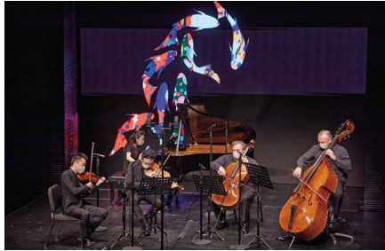
茶館室樂系列首個音樂會 HK Phil debut at the Tea House Theatre