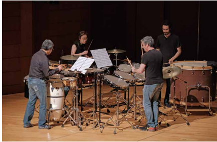
港樂擊樂小組於港大演出 HK Phil Percussion Section@HKU