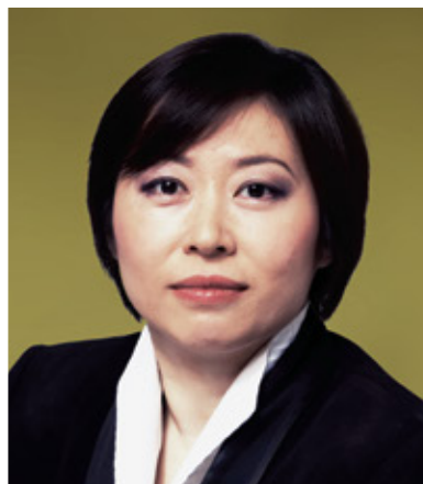
張弦 Zhang Xian

One of China's leading conductors, Zhang Xian, brings a programme of Roman portraits - Respighi's colourful tone poem which celebrates Rome, the eternal city. Chen Qigang's new major work, an HK Phil co-commission, receives its world premiere performance.