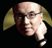
陳其鋼 CHEN QIGANG 作曲 composer

17 & 18-4-2015 Fri & Sat 8pm 香港文化中心音樂廳 Hong Kong Cultural Centre Concert Hall