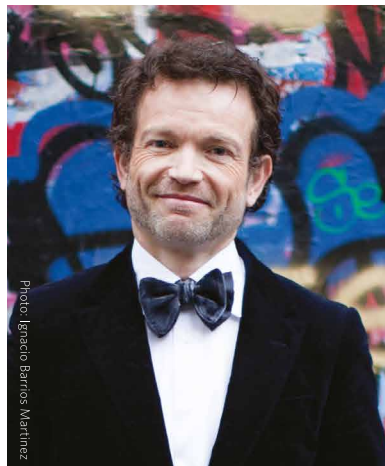
胡薩 Christophe Rousset 指揮 conductor

An evening of rejuvenating music – Mozart's youthful genius meets with the first masterpieces of his maturity. Mitridate , his first great success on the opera stage, was written for Italian audiences, and the overture bubbles with sunny wit and brilliance. The Divertimento in F also was intended for Italy and shows Mozart taking his first inspired steps with strings. That path would lead him to the pinnacle of the Sinfonia Concertante, one of the greatest of his solo works. The 29th symphony, perhaps his first completely assured masterpiece, rounds off the programme – not bad for an 18-year-old!