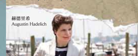
赫德里希 Augustin Hadelich

香港演藝學院香港賽馬會演藝劇院 Hong Kong Jockey Club Amphitheatre, The Hong Kong Academy for Performing Arts $420, $260, $80