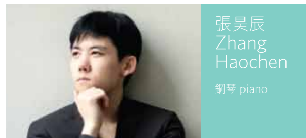
張昊辰 Zhang Haochen

Join us to hear the intimate and passionate music Schumann composed for chamber forces.