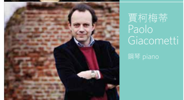
賈柯梅蒂 Paolo Giacometti