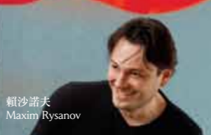
賴沙諾夫 Maxim Rysanov