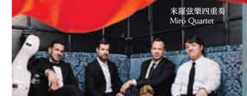
米羅弦樂四重奏 Miró Quartet

香港大會堂音樂廳 Concert Hall, Hong Kong City Hall $800, $420, $280, $120