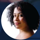
葛露絲 Tania Kross 歌唱家 vocalist