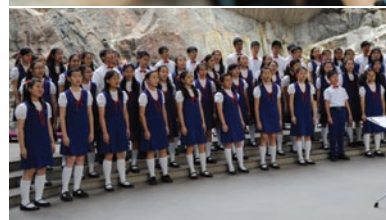
香港兒童 合唱團 The Hong Kong Children's Choir