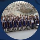
香港兒童合唱團 The Hong Kong Children's Choir