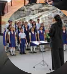
香港兒童合唱團 The Hong Kong Children's Choir