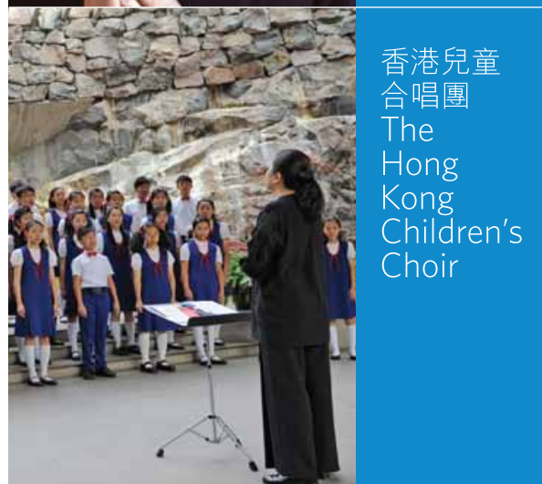
香港兒童 合唱團 The Hong Kong Children's Choir