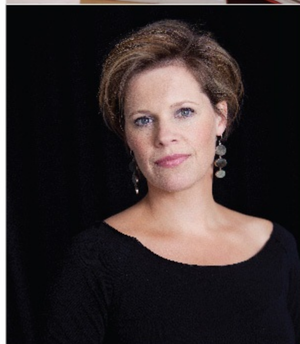
汀寧 Camilla Tilling