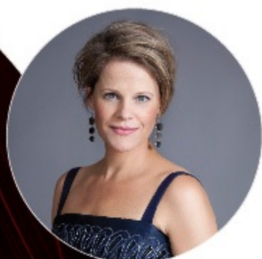
汀寧 Camilla Tilling 女高音 soprano