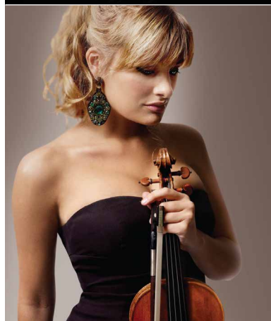
班娜德蒂 Nicola Benedetti