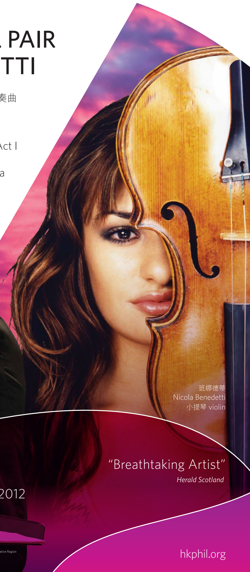
班娜德蒂 Nicola Benedetti 小提琴 violin

Musical America Conductor of the Year 2012