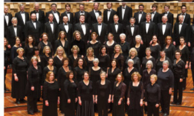
塔斯曼尼亞交響樂團合唱團 Tasmanian Symphony Orchestra Chorus