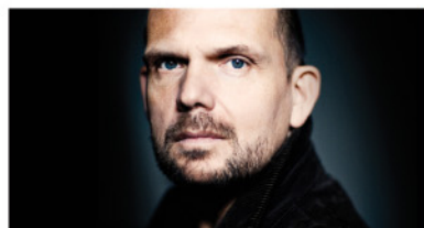
梵志登 Jaap van Zweden

Brahms composed his German Requiem as a work of comfort for the living. Weaving together biblical texts which he himself chose, he created a towering work – a great journey in music. Now treasured as one of the greatest German Romantic works for chorus, this Requiem has not been performed by the HK Phil in decades until Jaap chose it as his second inaugural programme.