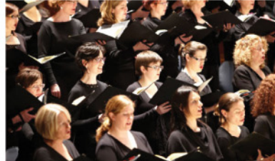
西澳交響樂團合唱團 West Australian Symphony Orchestra Chorus