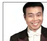
孫斌 Sun Bin