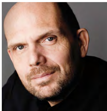
梵志登 Jaap van Zweden 音樂總監 Music Director