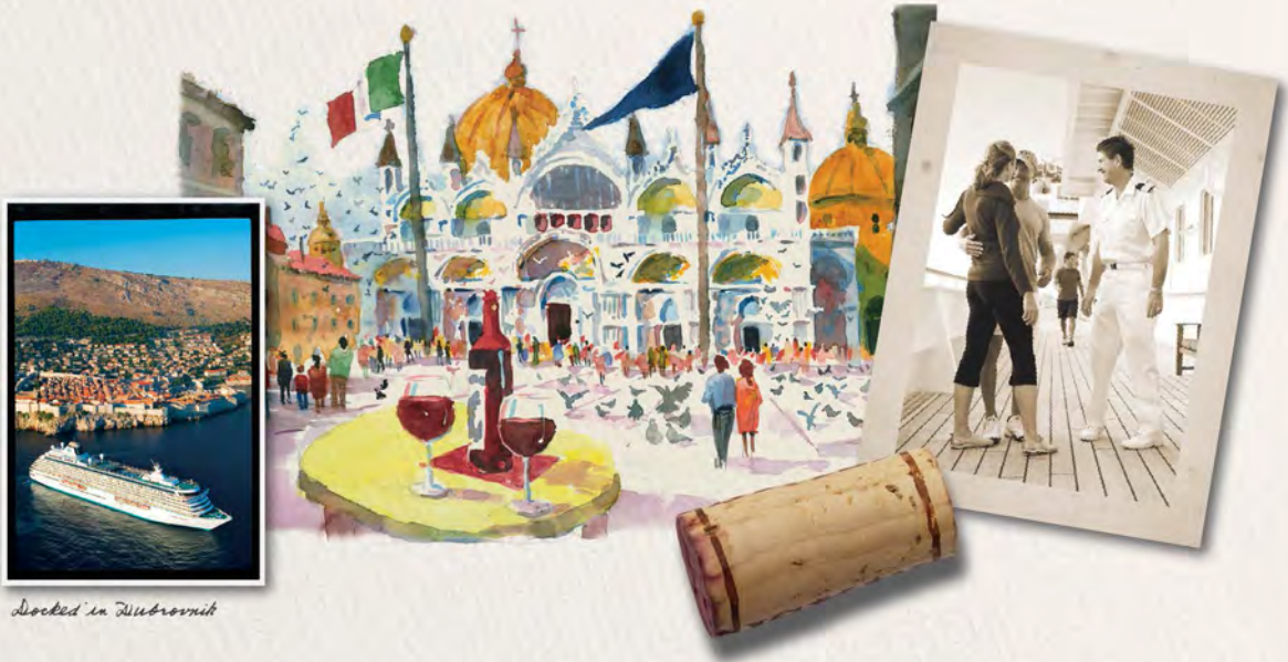
Docked in Dubrovnik

We invite you to discover some of the most fabled destinations on Earth with some of the best fares in history. Book any of these Crystal Cruises voyages to begin a new story with the All-Inclusive Experience of the World's Best: