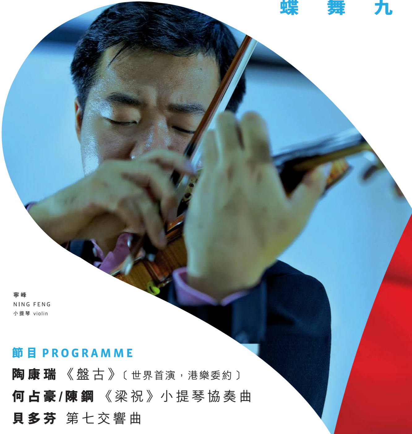
寧峰 NING FENG 小提琴 violin