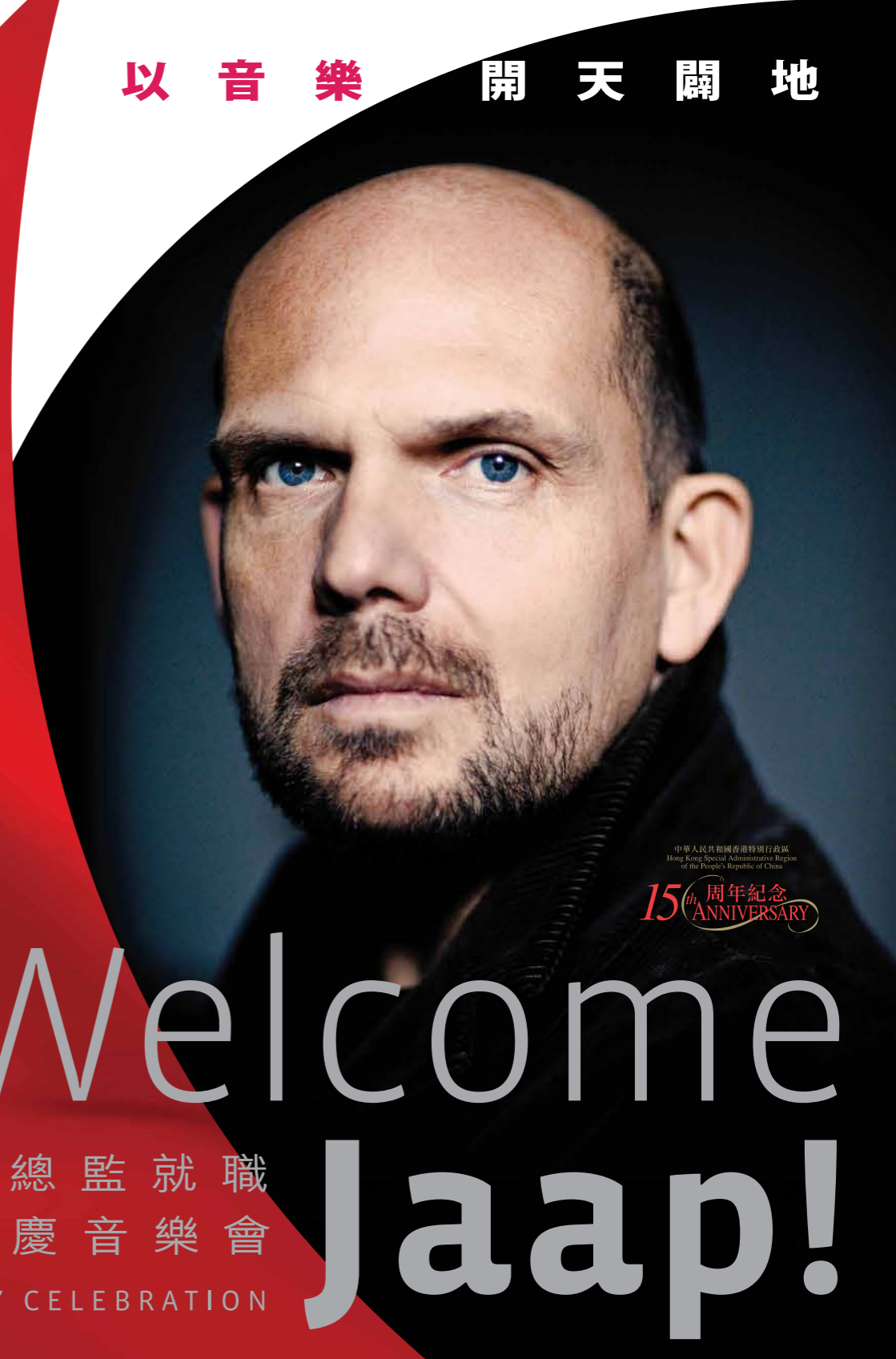
梵志登 JAAP VAN ZWEDEN 指揮 conductor