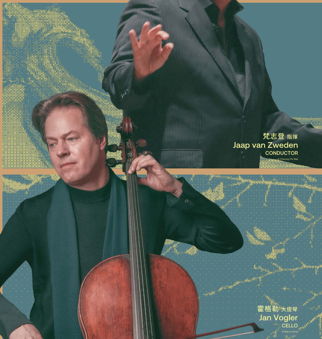
梵志登 指揮 Jaap van Zweden CONDUCTOR