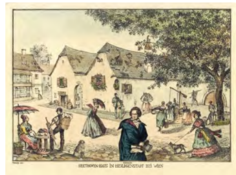
Beethoven Haus in Heiligenstadt, in which the Pastoral Symphony was written.

The first movement of the Pastoral is very different indeed from any of its precursors: it is more expansive, and the first theme has a relaxed, open, song-like quality quite unlike the taut, muscular thematic springboards that set the Eroica and the Fifth symphonies in motion. Beethoven's subtitle describes it well: this is not an explosion of emotion, but a gradual “awakening of cheerful feelings”. At the heart of the movement, the rhythm of the opening theme becomes a repeated pattern, with chugging figures in the lower strings, in a series of long crescendos – easy to imagine the regular turning of the carriage wheels as the city is left behind.